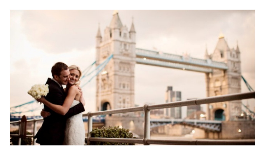
Tower Bridge Shad Thames