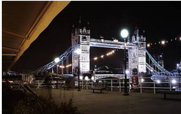
Night time View from the Bar & Grill Terrace

Stretching 150 feet along the Thames riverside, the flexible elegant venue spaces offers many options for your event, it comprises a restaurant and bar and grill, both with terraces; a private room; a wine cellar. Your drinks reception would be held in the bar and grill or on the summer terraces and after dinner guests are invited back into the bar area for dancing.