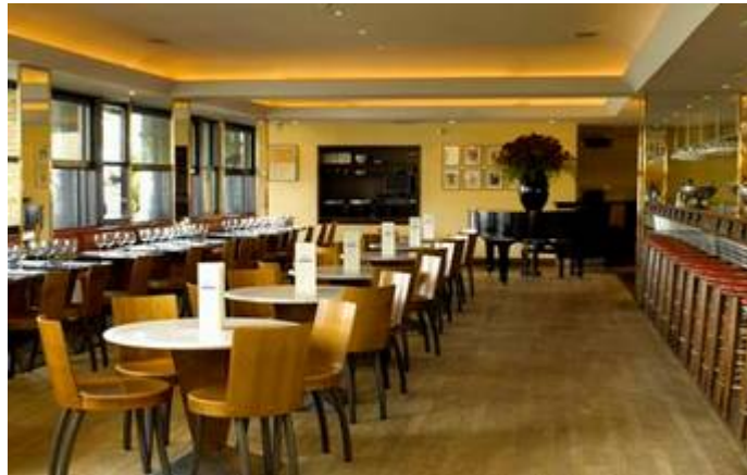
The Bar & Grill

36d Shad Thames Butler's Wharf London SE1 2YE TELEPHONE 020 7940 1850 - FAX 020 7940 1835