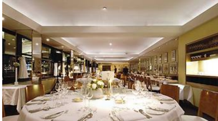
The Main Restaurant

THANK YOU YOUR INTEREST IN LE PONT DE LA TOUR TO CELEBRATE THE WONDERFUL OCCASION OF YOUR WEDDING DAY, WHICH WE WOULD BE DELIGHTED TO HOST FOR YOU.